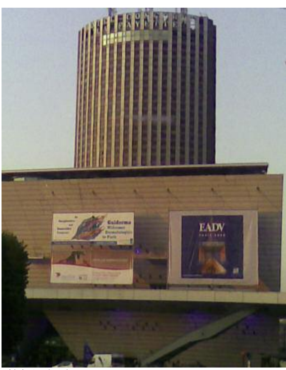
Palais des Congrès, Paris.

In Prof Calzavara-Pinton's study, 52 patients with 112 biopsy-proven lesions of BD and SCC were treated in an outpatient setting with MAL-PDT. The MAL cream (160mg/g) was applied 3 hours prior to illumination with a light-emitting diode source (wavelength range 635±18nm; total dose 37J/cm²). The treatment was repeated 7 days later. The