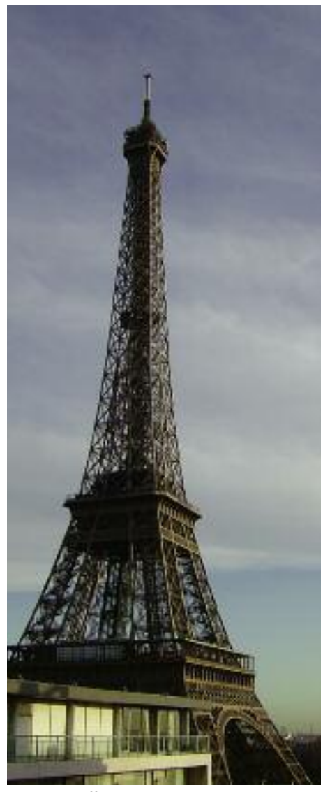
The iconic Eiffel Tower, Paris.

An aggressively growing BCC of the morphea type which is localised on the face would be an example of the need for FD. Results in the literature imply that the technique can be applied as a useful tool for indicating the tumour boundary of these aggressive BCCs.